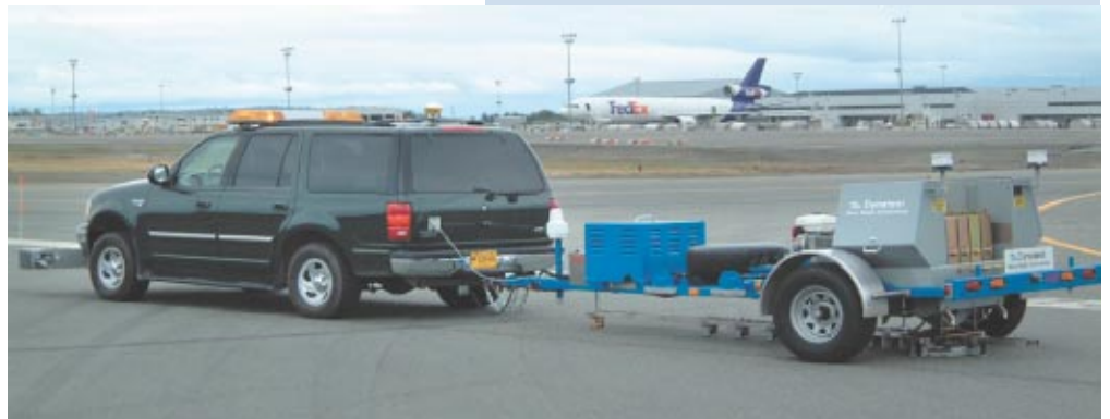
HEAVY WEIGHT DEFLECTOMETER