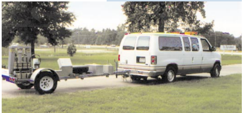
FALLING WEIGHT DEFLECTOMETER

Dynatest was also the first to introduce a heavier loading FWD, the Dynatest Model 8081 HWD. With an expanded loading range, simulating heavy aircraft such as the Boeing 747 (one wheel), the HWD can properly introduce anticipated load/deflection measurements on even heavy pavements such as airfields and very thick highway pavements. The wider loading range also provides the consultant with a load/deflection instrument appropriate for both roads and airfields as required.